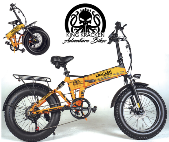
Embark on Uncharted Trails with Kracken Adventure Bikes