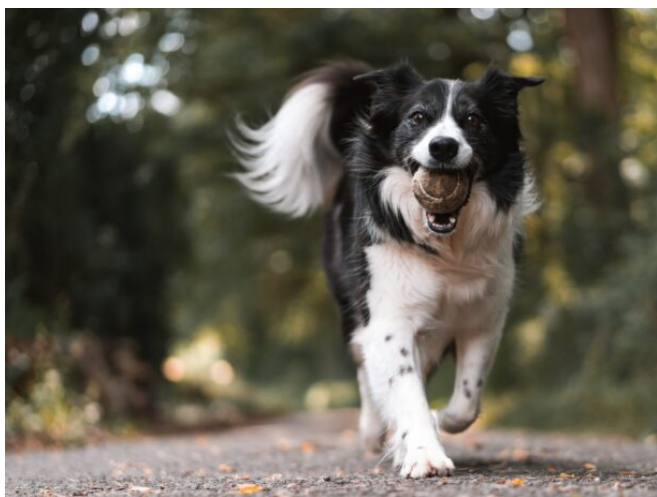
5 Ways to Keep Your Pet's Heart Healthy